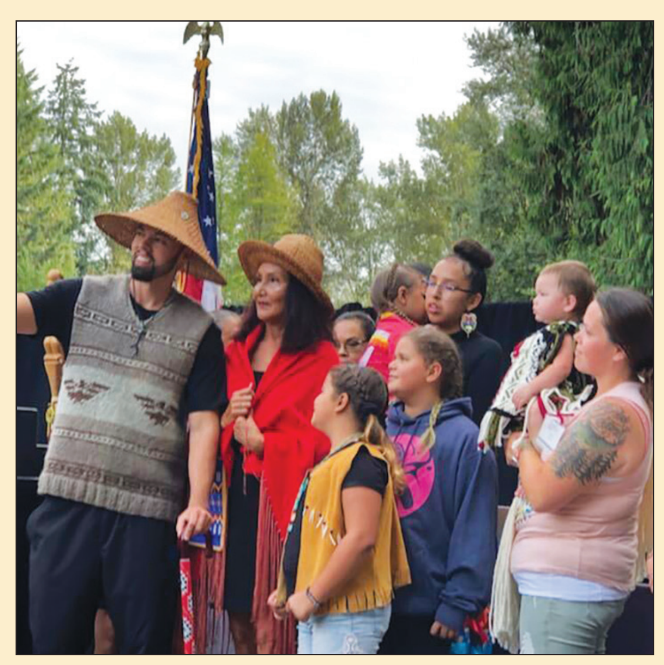
The Salmon Bake Fundraiser fashion show featured all Tulalip made items, modeled by Tulalip tribal members.

PRSRT STD US Postage PAID cound Publishing