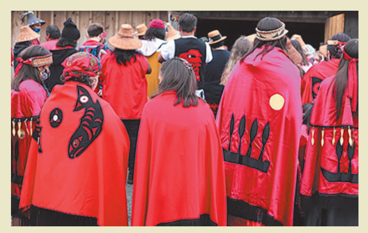
Tulalip Tribes Salmon Ceremony, 2021.

Since 1934, this is the first nationwide recognition, where we have seen governors, school-board leaders, and institutions unite and acknowledge this day. President Joe Biden recently released a statement saying, "We must never forget the centuries long campaign of