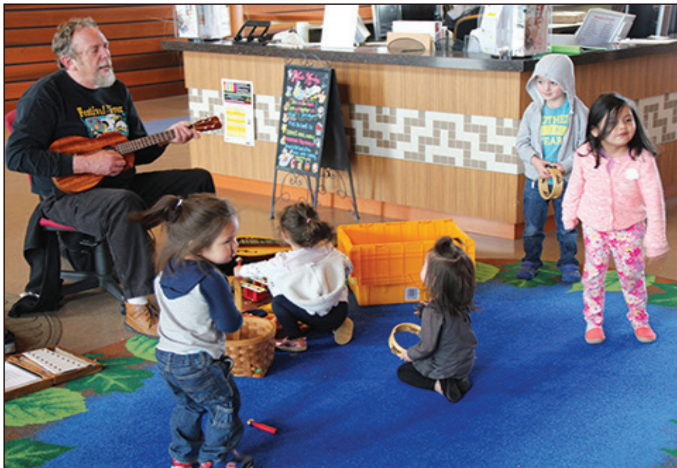
Alley-Oop and his sunshine band of toddlers.