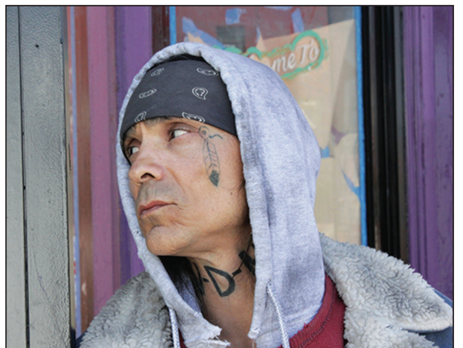
Award winning film and television actor Zahn McClarnon plays the character Bill in Mekko .