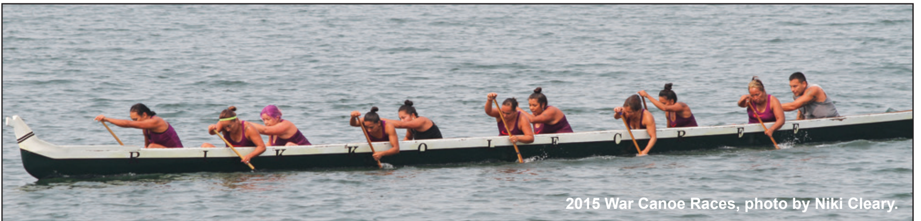
2015 War Canoe Races, photo by Niki Cleary.