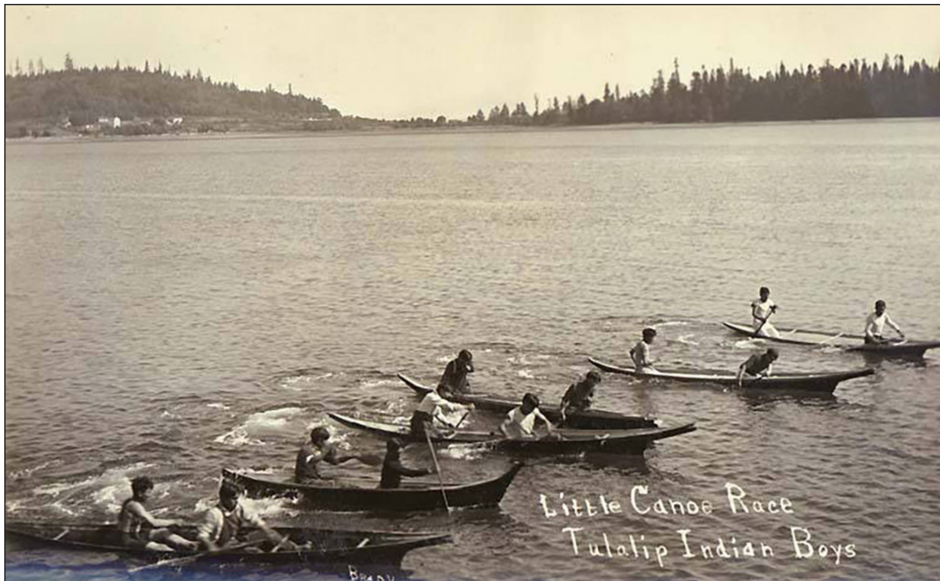
Above: Little canoe race, Tulalip Indian boys, ca. 1912.