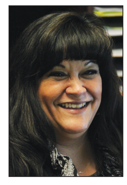
"Improvements to youth programs, maybe some new programs."