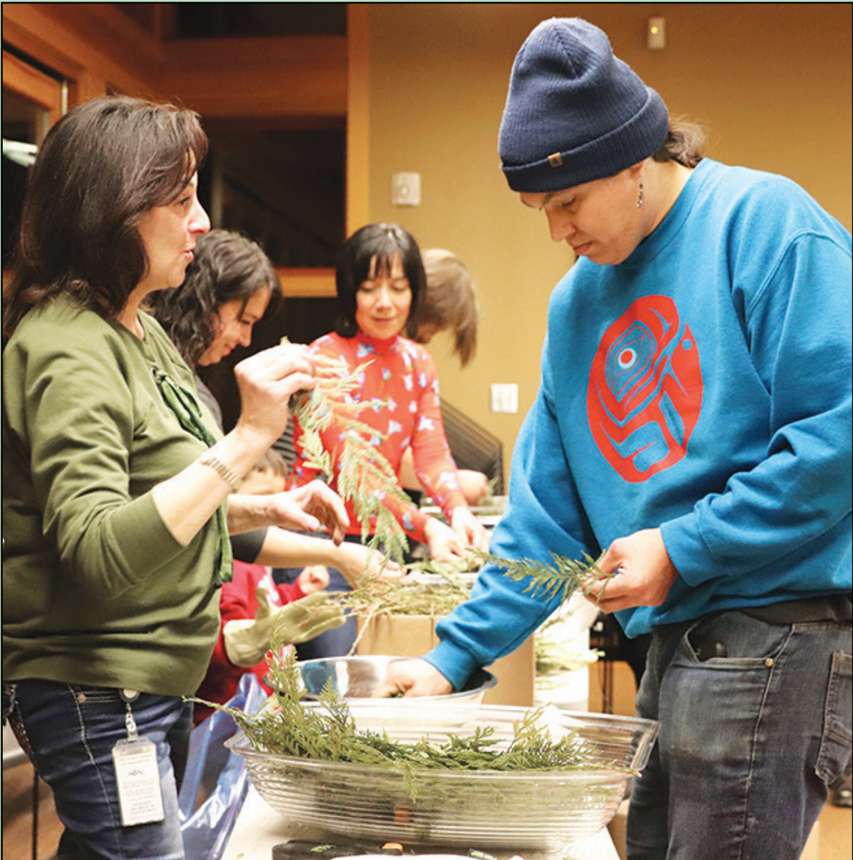
Tulalip tribal members harvest cedar and share the gift of gathering during the Rediscovery program's monthly Native Plants workshop.