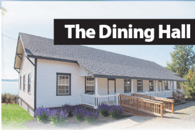
The Dining Hall

This event will start with a brief informational session and Narcan® distribution followed by a candlelight vigil.