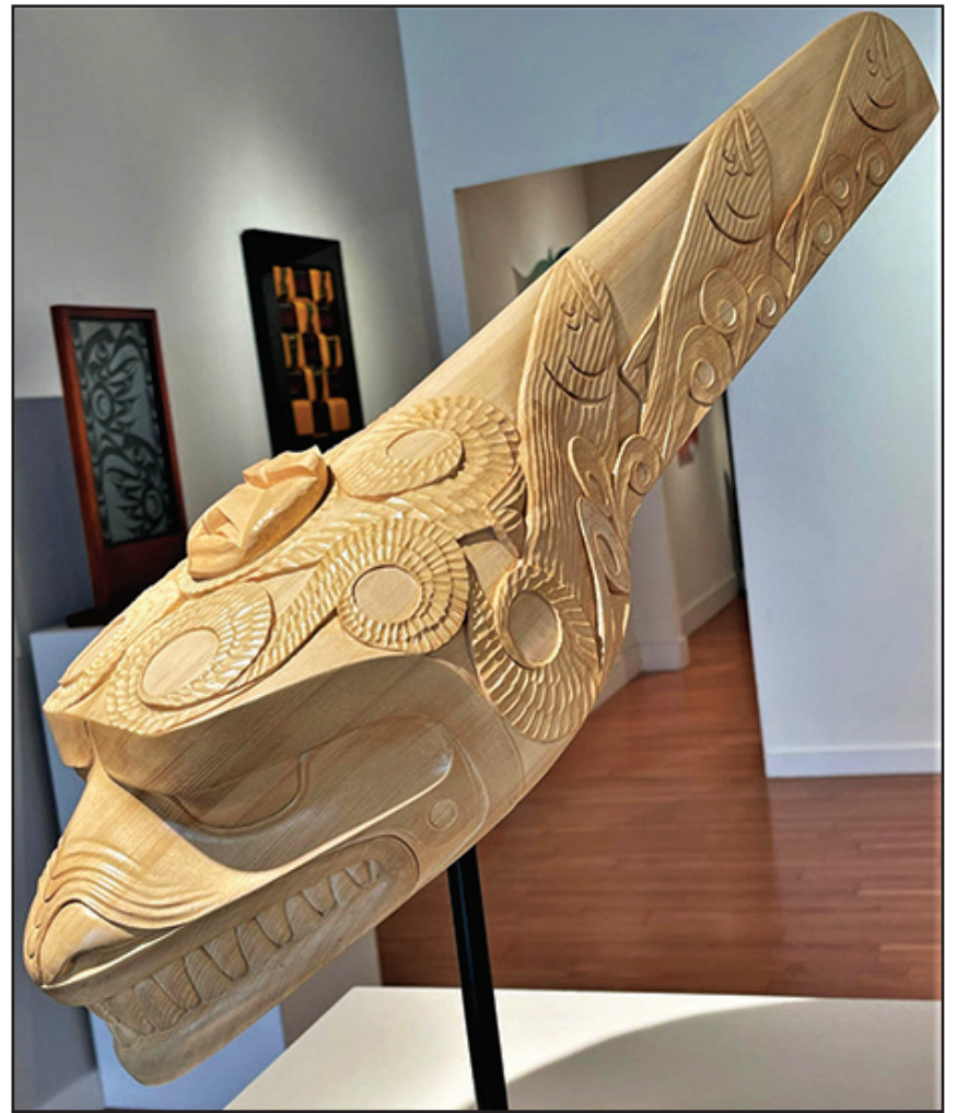
Whale Mask. Hand carved yellow cedar.